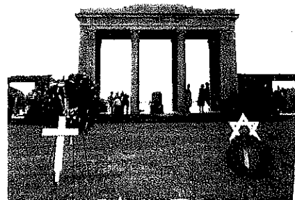
WWI Memorial at the monument's first dedication ceremony on August 19, 1923.

-Report of Special Committee to the Village of Southampton, August 1921