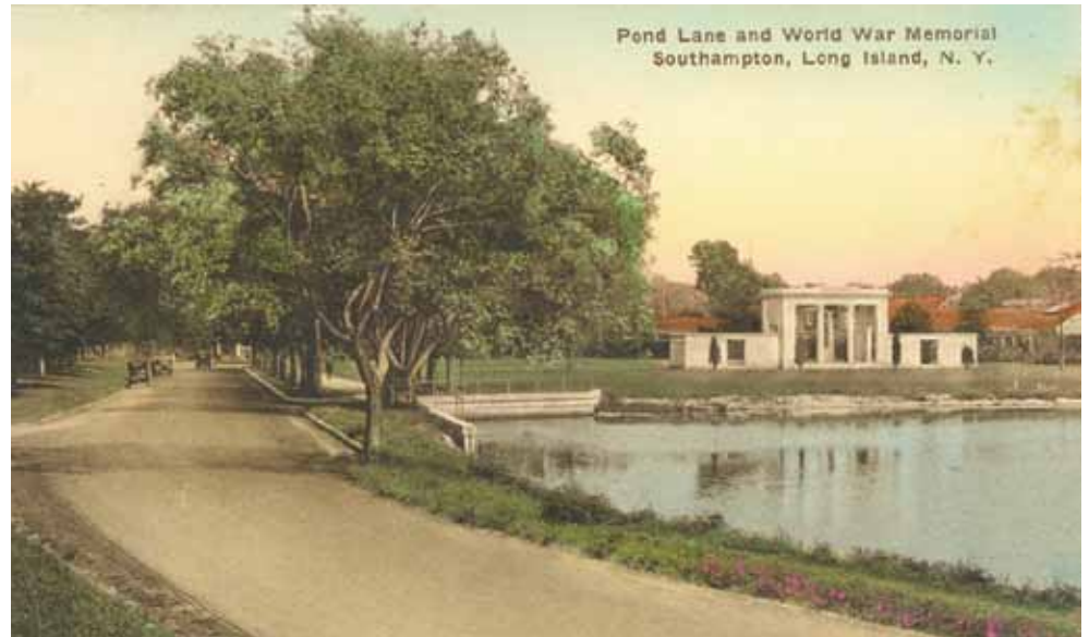
Pond Lane and World War Memorial Southampton, Long Island, N. Y.